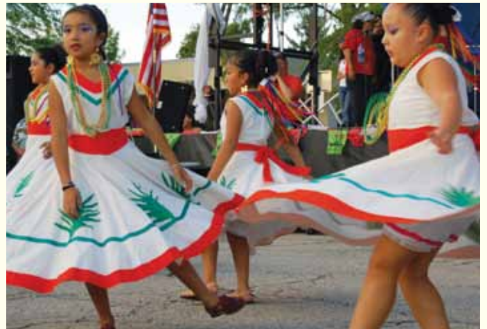
Dancers from the renowned Ballet Folklorico Quetzacoatl perform in many age categories.

West Chicago City Museum, 132 Main Street (630) 231-3376 • www.westchicago.org/museum Tues.- Fri. 10:30 a.m. - 3:30 p.m. Sat. 12:00 - 3:00 p.m.