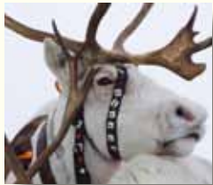
Live reindeer are one of the many wonders of the holiday season and Frosty Fest. Mark your calendar to be downtown on Saturday, December 3, 2011 for the dazzling event.