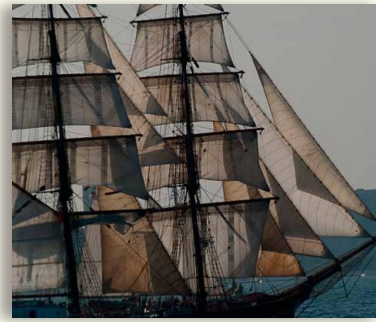
Sheets

Thurs. & Fri. 12:00 - 8:00 p.m. Sat. & Sun. 12:00 - 4:00 p.m.