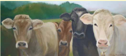
Hello Girls, painting by Heide Morris

It’s not too late! There are just a few of the 2011 “History of Public Schools in West Chicago” calendars left and they can be purchased at the City Museum for only $10.00. This collectable calendar contains archival and current images of local schools from the 19 th century to the present. The