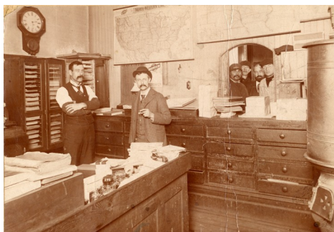
West Chicago C&NW depot station agent's office

What came before radios and cell phones? Explore the various types of communication devices that have been used by railroads including lanterns, the telegraph, message hoops and semaphores during this program on